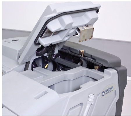
Cleaning of the machine is easy thanks to the tip out recovery tank opening with debris tray.