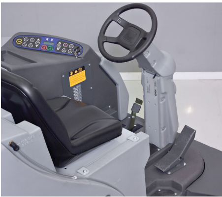
The new Kubota engine improves user comfort through reduced vibration.