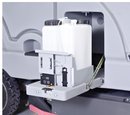
The on-board Ecoflex concept system provides productivity and savings through accurate dispensing

SERIOUS CLEANING DEMANDS A TRULY PROFESSIONAL MACHINE