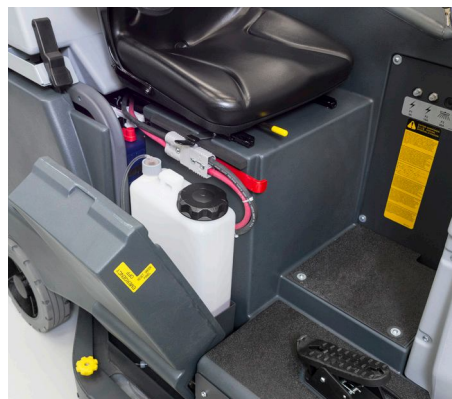
Ecoflex chemical kit (optional): easy accessible detergent cartridges