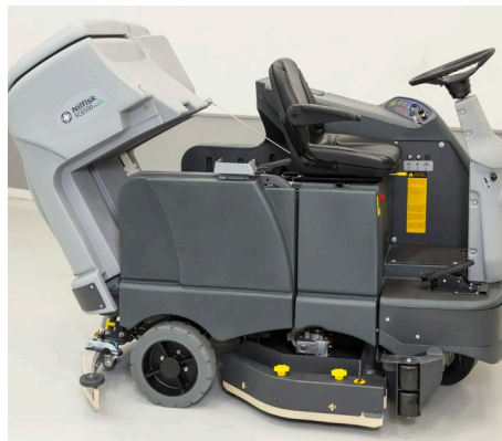
Tip-out and lift-off recovery tank