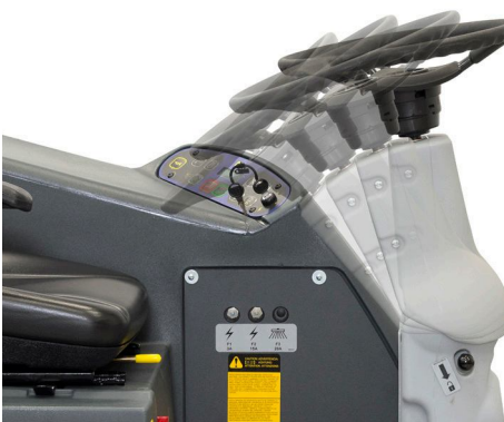
Tilt steering wheel for easy boarding, plus ergonomically designed operator compartment for safety and comfort