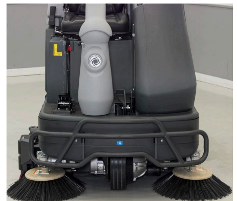
Dual side brooms (cylindrical models) deliver true edge cleaning