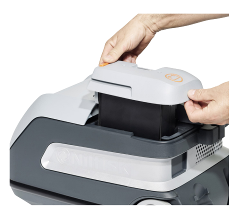
Easy access to the battery pack makes re-charging and change of battery a simple procedure