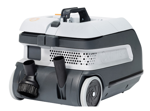
User friendly and easy to reach accessories