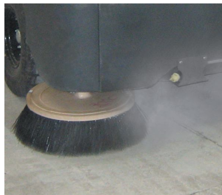
The exclusive DustGuard™ system effectively controls airborne dust by providing a fine mist of moisture to the front and side brushes

PERFORMANCE AND RELIABILITY WITH A CLEAN CONSCIENCE