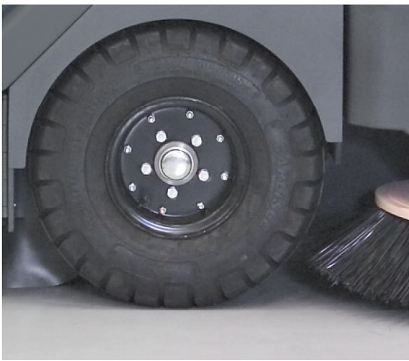
The large wheels give a smoother ride