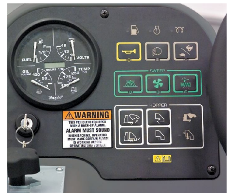
Operation of the SW8000 could not be easier. One-Touch™ control shortens operator-training time and improves the cleaning result