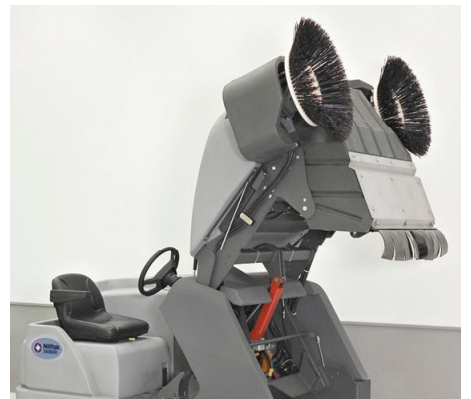
The SW8000 has a superb high-dump capability up to 152 cm from ground level for easy and convenient emptying