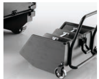
Wheeled hopper with optional mini containers