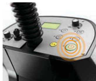
One touch start activates all main functions