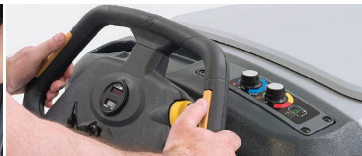
No confusing buttons or switches for a simple and easy to use machine.