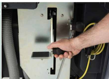
A simple mechanical deck lever removes the complexity, unreliability and service costs associated with alternative methods.