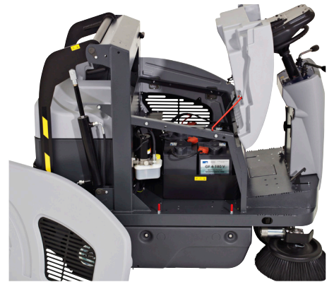
Maintenance is easy since no tools are needed for broom and filter removal and easy access to all components makes maintenance and service fast and easy