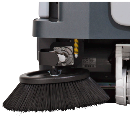
DustGuard™ misting system adds to the dust free sweeping improving the environment for operator as well as the surroundings (optional)