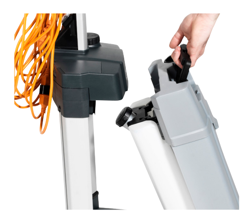
Each tank can be removed quickly and carried in one hand

The ergonomic handle can be tilted down for effective cleaning in low positions. And the detachable cord is easy stored on the handle hook.