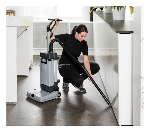
The optional manual suction hose is ideal for cleaning any unreachable area or spot cleaning.