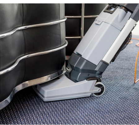
The SC100 clean in a position height of just 25 cm