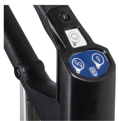
You will remain in full control of the scrubber dryer thanks to the intuitive touch display with two water settings and a solution indicator, alerting you if the tank is empty