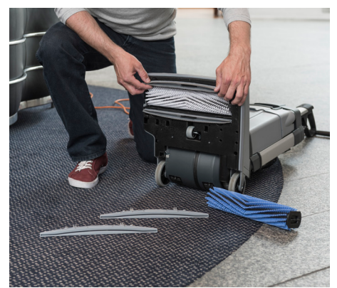
Apart from getting faster cleaning of hard floors, you will also be able to freshen up smaller carpets, including removal of spots, by adding an optional carpet kit. Brush and squeegees can be removed without any tool making daily maintance operations easy and fast